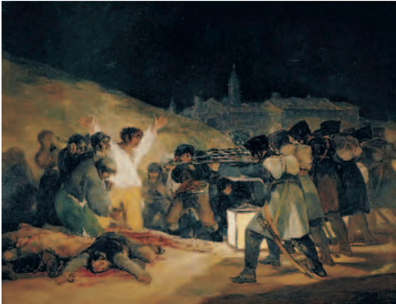
▲ FIGURE 13.16 The figures are arranged in this painting so that they seem in opposition to each other. Which is the most important figure in this composition? How has the figure been made to stand out? What is the feeling or mood of the piece?

Francisco Goya. The Third of May, 1808 . 1814. Oil on canvas. Approx. 2.64 × 3.43 m (8'8" × 11'3"). Museo del Prado, Madrid, Spain.