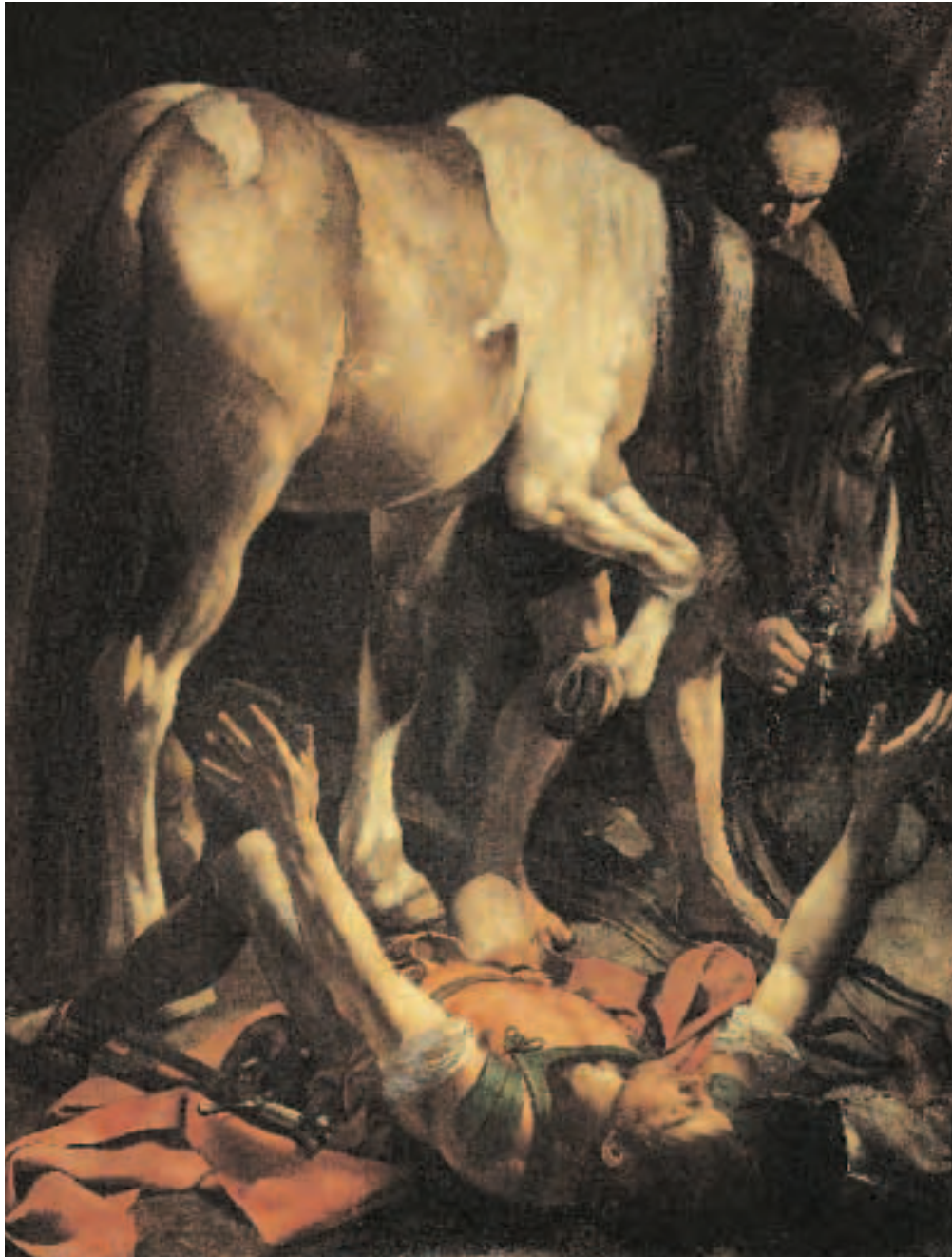
◀ FIGURE 13.12 Notice the use of light in this picture. It is not a natural light. Where does it come from? What mood is created by it?

Dutch Protestants did not want religious paintings and sculptures in their churches. Dutch artists had to turn to