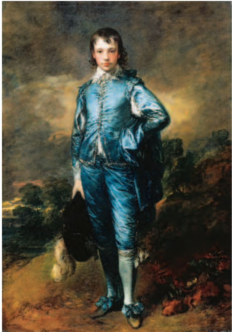
Figure 13.15 , Gainsborough's most famous painting, resulted from a professional rivalry. A rival painter gave a lecture at the Royal Academy of Art and stated that blue, a cool color, should always be used in the background, never in the main part of a picture. When Gainsborough heard this, he considered it a challenge and painted a portrait of a boy dressed entirely in blue.

Thomas Gainsborough. The Blue Boy . c. 1770. Oil on canvas. 177.8 × 121.9 cm (70 × 48"). The Huntington Library, Art Collections, and Botanical Gardens, San Marino, California.