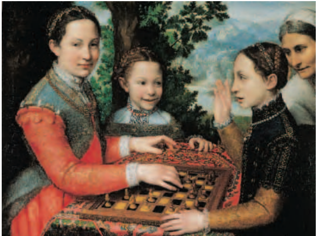
▲ FIGURE 13.9 Notice the dramatic use of color in this painting. Observe the detail of the dresses the sisters are wearing. What does this tell you about them and their social status?

Northern artists had little interest in recreating the classical art of Greece and Rome. They placed greater emphasis on