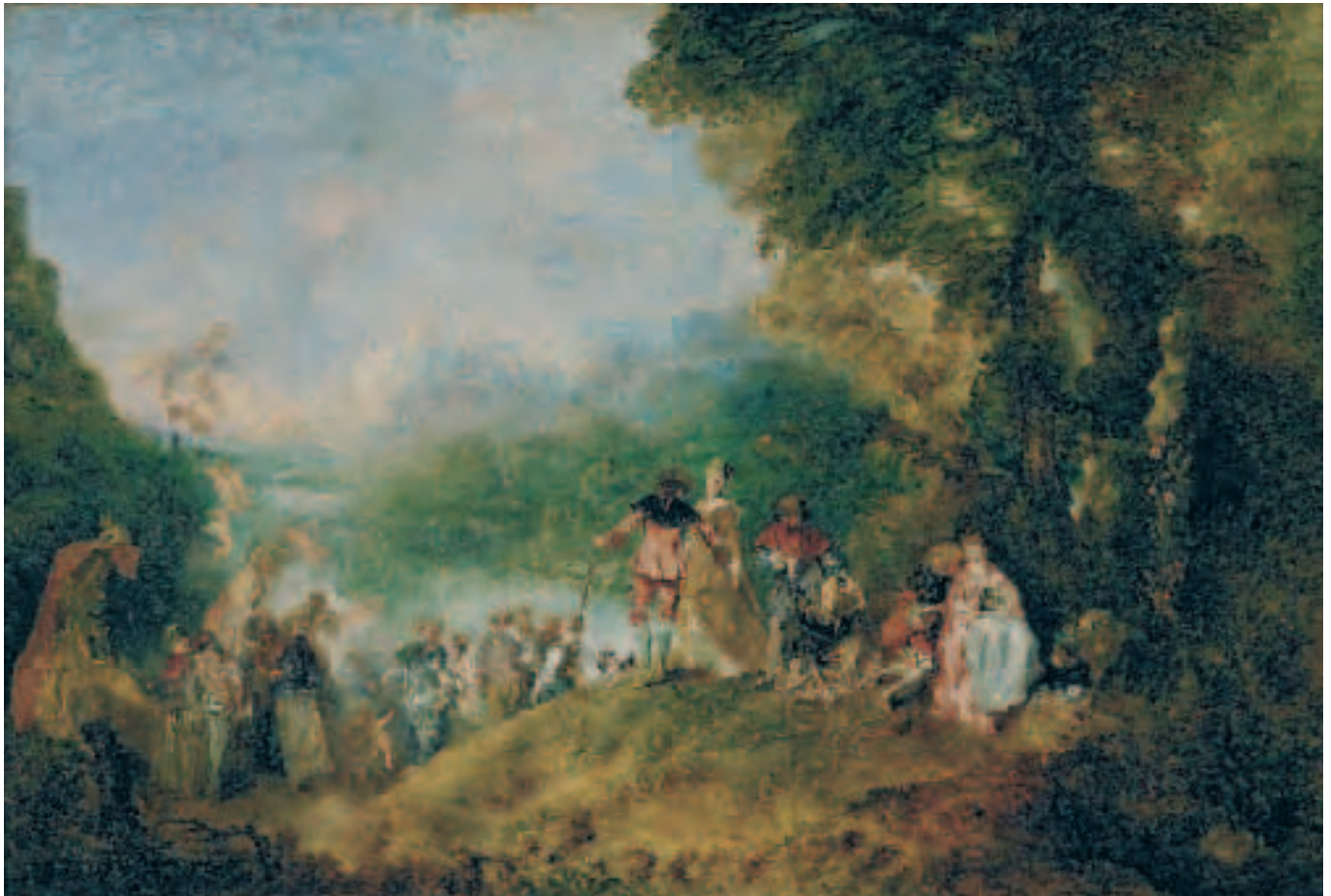
▲ FIGURE 13.14 Describe the dress and manners of these people. Notice how the colors and shapes blend together for a dreamlike, misty quality. Is this a happy occasion? How do you know?

In England, artists modified the Rococo style. They used its delicate, light-washed techniques but rejected artificial subject matter. One of the most famous English painters of this period, Thomas Gainsborough ( gainz-bur-roh ), began his artistic career as a landscape painter but later became a famous portrait painter for members of English high society.