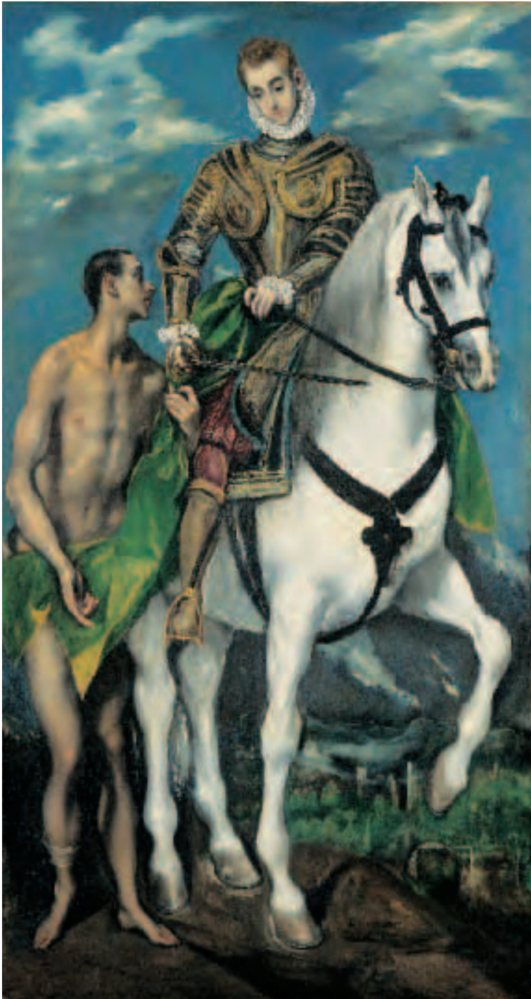
▲ FIGURE 13.11 Notice the dreamlike quality of the background. It causes the viewer to focus on the two figures in the foreground. What appears to be happening in this painting?

El Greco. Saint Martin and the Beggar . 1597/1599. Oil on canvas; wooden strip added at bottom. 193.5 × 103 cm (76 1 / 8 × 40 1 / 2 "). National Gallery of Art, Washington, D.C. © 1998 Board of Trustees. Widener Collection.