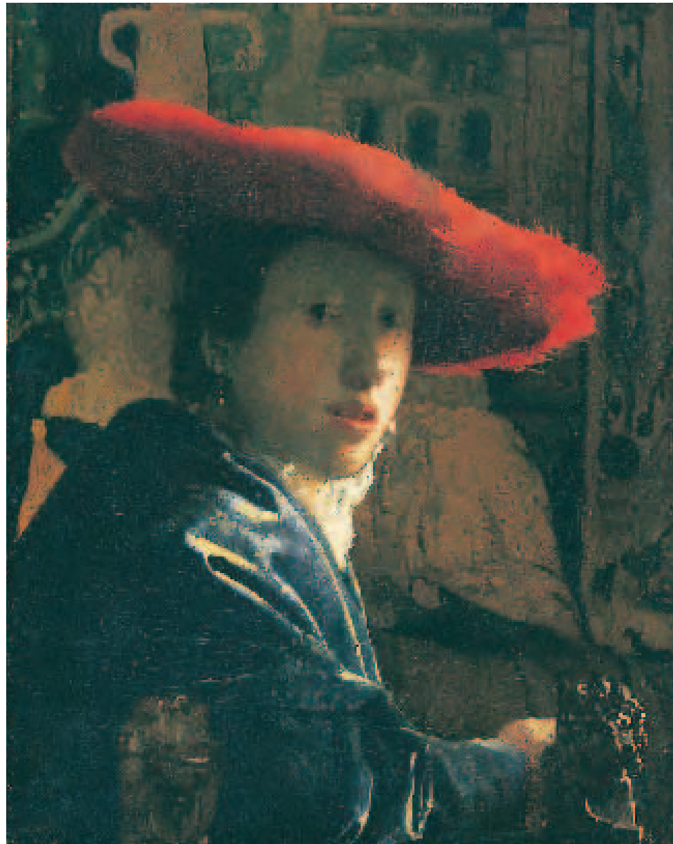
► FIGURE 13.13 This portrait depicts an ordinary woman engaged in an everyday activity. How does Vermeer add interest to the painting? What mood or feeling does it evoke?

Jan Vermeer (yahn vair- meer ) is another important Dutch artist. For several hundred years, his artwork remained unappreciated, but in the second half of the nineteenth century critics recognized his artistic genius. Vermeer is best known for his use of light and texture. Figure 13.13 shows his talent in using dark and light values to express a feeling or evoke a mood.